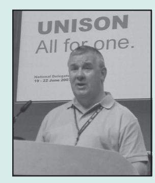
"take account of the views of users and staff"

UNISON's National Delegate Conference made fundamental decisions about a coordinated fight for pay south of the border across health and local government - and a trade union wide fight against privatisation, with national and regional demonstrations. It also